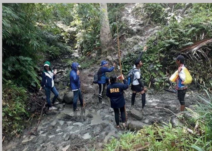
Difficult paths taken by the BFAR XII staff to get to Sitio Akbual, Upper Suyan, Malapatan for the Ridge2Reef program which aims to provide the Bla'an brethren basic government services.